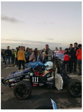
Orientation Day 2019

For BlueStreamline, the beginning of each academic year carries a special significance. The 1st October also means the beginning of a new season, a new team structure, new challenges, resolutions and hopes.